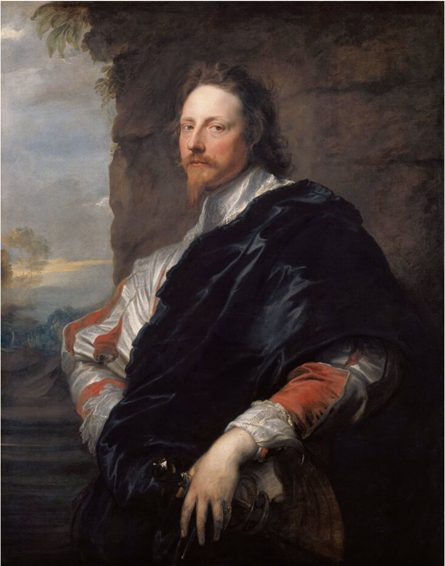
Portrait of Nicolas Lanier / Antony van Dyck / 1632 / Kunsthistorisches